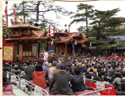
Nagahama Hikiyama Festival

長浜曳山祭総当番 Naaghama Hikiyama Festival Sotoban (executive committee)