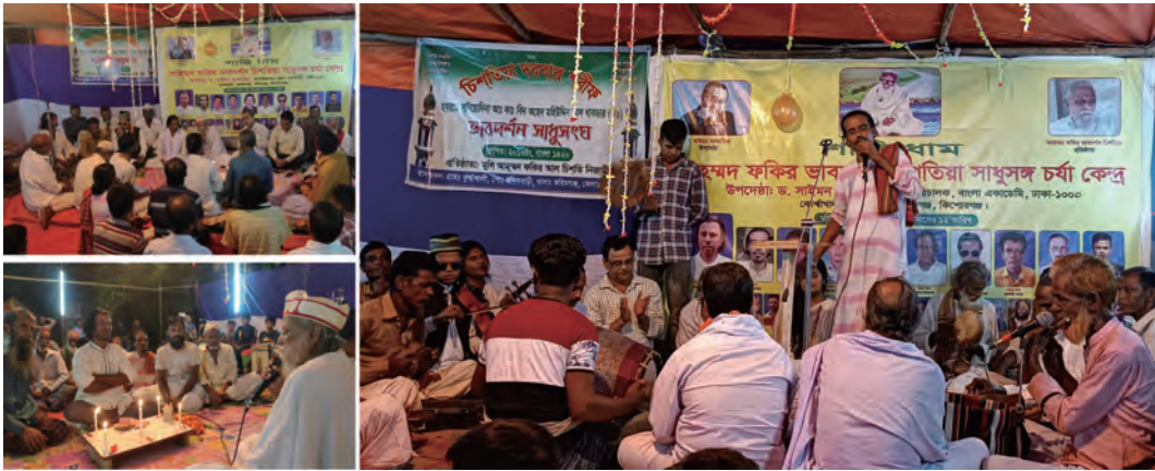
Figure 5. In the Annual Gathering of the Sufi devotees, they discuss the Sufi theories, Pray and perform Sufi songs, Shantidham Bhabdarshan Charya Center, Kishoreganj.