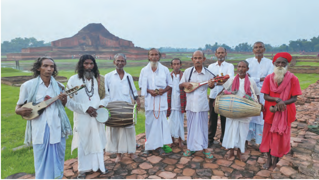
Figure 2. Charyapada performers at the Paharhpur Buddhist archeological site.