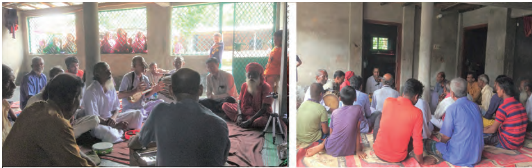
Figure 3. Discussion with the artists of Paharhpur Bouddhabihara Charya Practice Center.

A foundation named Bhābanagara Foundation incepted Bhābanagara Sadhusanga in 2014, a program to revive the ancient Charya songs. In the course of around one decade, almost one thousand sadhaka singers all over Bangladesh have been practicing the ceaseless initiative to revive Charya Songs. Every Wednesday, the traditional singers from different corners of the country get together at the Suhrawardy Udyan and practice Charya Songs.