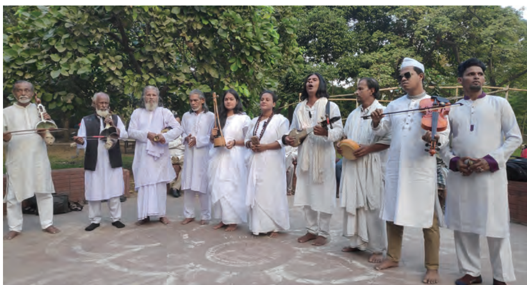
Figure 1. During COVID-19 Pandemic, Bhabanagara Sadhusanga continued songs of Charyapada Revival Activities in limited manner at Suhrawardi Udyan in Dhaka.

Generally, Charyapada was performed prominently by Buddhist priests and the traditional body-centric saints in the ancient Bengal through singing, dancing, and acting from 650 AD to 1100 AD. In 1200 AD, this tradition disappeared encountering the Muslim invasion. However, the manuscripts of this literature were somehow preserved in the Royal Library of Nepal. Haraprasad Shastri, a Bengali scholar, discovered the manuscripts in 1907; and Bangia Sahittya Parishad of Kolkata published the manuscript in 1916.